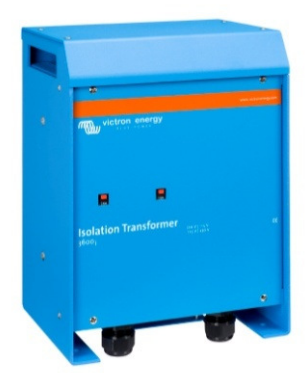
Isolation Transformer 3600W