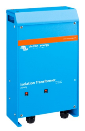
Isolation Transformer 2000W