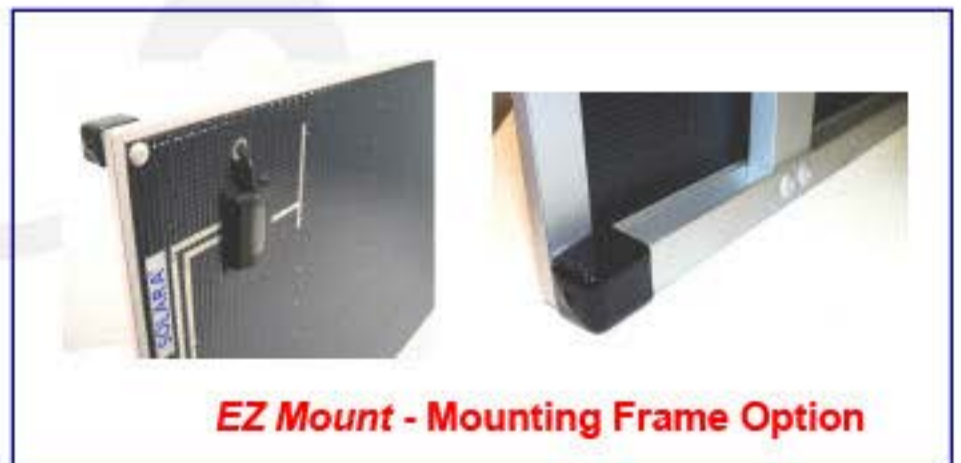
EZ Mount - Mounting Frame Option